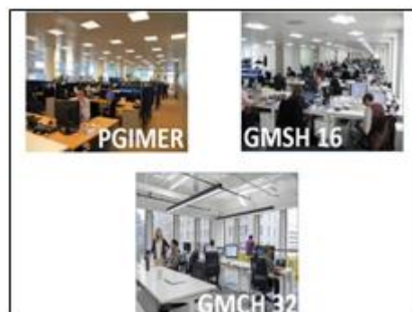
Fig. 4. Individual HIS systems.

Clinical research is very difficult as data is stored and owned by different hospitals. At present all the three major hospitals of UT Chandigarh are maintaining patient's information and some staff manage operations manually and even some HIS modules have implemented on their own individual HIS system. The major issue is that the patient cannot get proper treatment in other hospitals. If any patient getting treatment in GMSH Sector-16 and if he want to visit PGIMER, Sector-12, Chandigarh for better treatment which is possible only when existing patient's information available on sharing basis. This is not possible at present due to non-sharing of patient data.