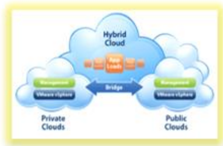
Figure 3: Cloud Deployment Types

operated and managed by the cloud service provider, academic, or government organization or some combination of them and it reside on the premises of the cloud service provider. E.g. the Amazon Elastic Compute Cloud (EC2) provides users a capacity to lease virtual computers on which to run their own applications. The users pay only for what they have used and EC2 executes within Amazon's network infrastructure and data centers.