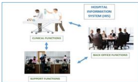
Fig. 1. Hospital information system (HIS).