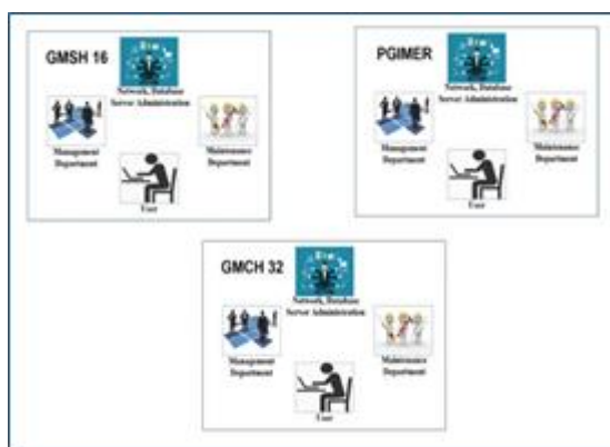
Figure 6: Resource Wastage